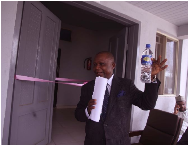
Prince Lateef Fagbemi Chairman, YCT Governing Council Commissioning YCT Water Project

The Chairman, Governing Council, Yaba College of Technology, Prince Lateef Fagbemi (SAN), has commissioned the College commercial water plant.