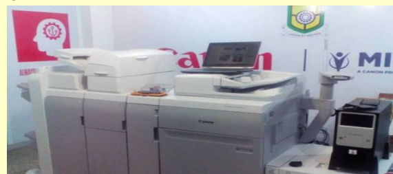
The 850 Series Digital Imaging Machine Donated by Canon to Yabatech

It is an opportunity for the students to access enhanced training to develop their skills and interact with professionals who, in addition to a solid knowledge of the sector, have a clear idea of the industry needs in Nigeria; he added.