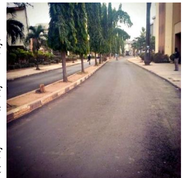
Yabatech rehabilitated road

Car owners that ply the College roads can now heave a sigh of relief as a result of the fixing of the roads for easy access and movement, which no doubt is a great advantage to the College image.