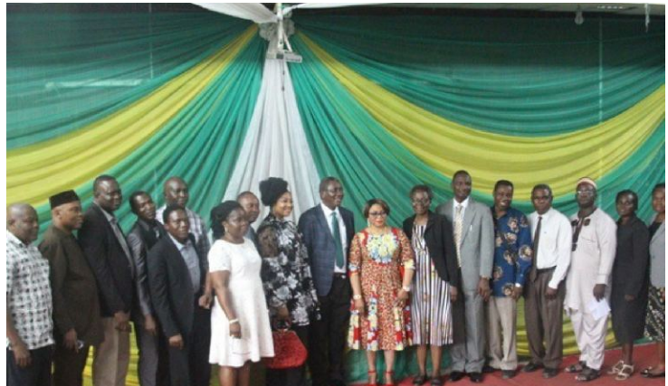
The donor, Yabatech skill acquisition Centre, Mrs. Folorunsho Alakija (M) YCT Management team and other dignitaries at the handing over/commissioning of the centre

The richest woman in Africa highlighted the positive effects of a skillful economy as the emergence of self-development, cottage industries, reduced unemployment and a prosperous economy. “Prosperity does not come overnight but through doggedness and determination. Everyone must contribute to the development of Nigeria, she advocated.