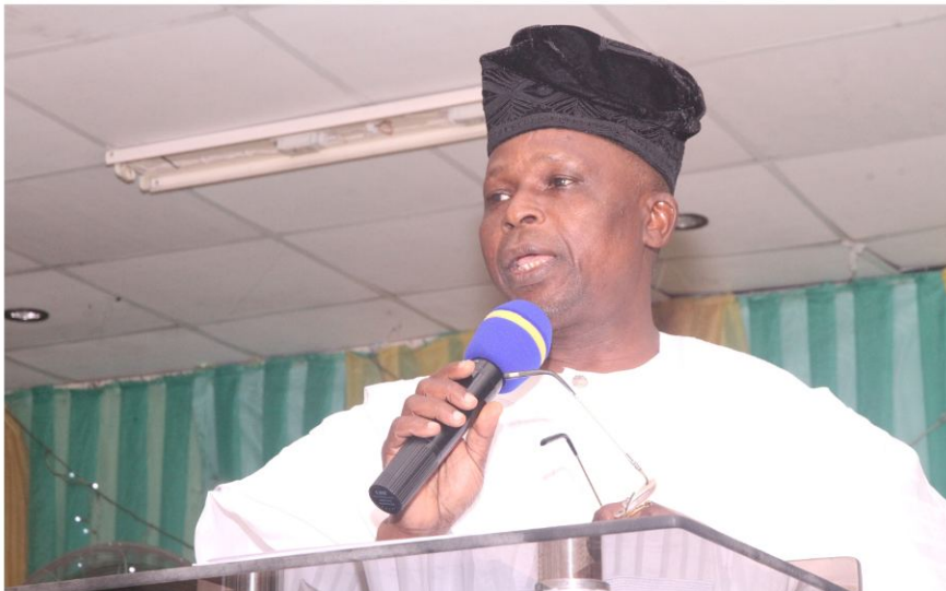
Prince Lateef Fagbemi (SAN) delivering his address at one of the College functions

The Yaba College of Technology Governing Council has challenged the Alumni Association of the College to support less privileged students with scholarships and the College through endowment funds.