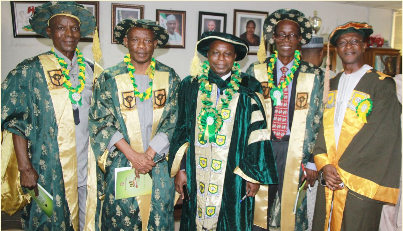
A cross section of the executives, YCT Alumni Association and members of the College Governing Council during the College Convocation Ceremony