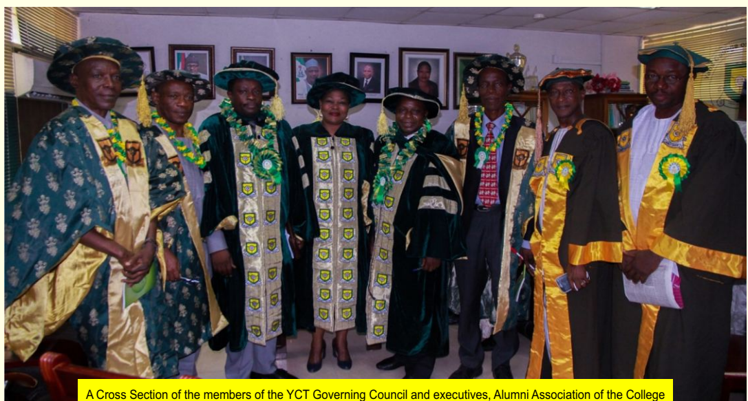
A Cross Section of the members of the YCT Governing Council and executives, Alumni Association of the College