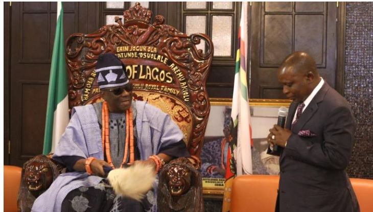
Prince Lateef Fagbemi (R) Paying homage to Oba of Lagos, His Royal Majesty, Oba Akiolu

issues militating against the growth of the Alumni Association with a view to ensuring that College benefits from its large Alumni members present all over the world and to critically examine the urgent need of establishing branches in all 36 states of Nigeria and the Federal Capital Territory within the next one year.