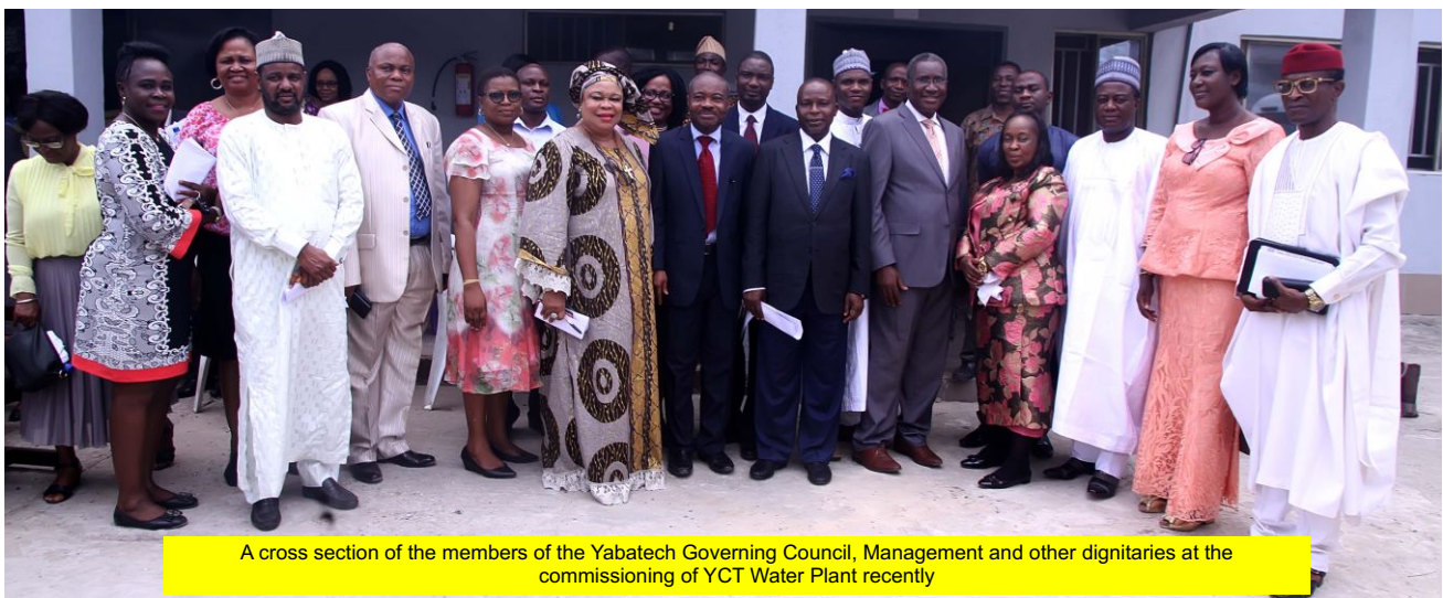
A cross section of the members of the Yabatech Governing Council, Management and other dignitaries at the commissioning of YCT Water Plant recently

According to him, “at the inception of this