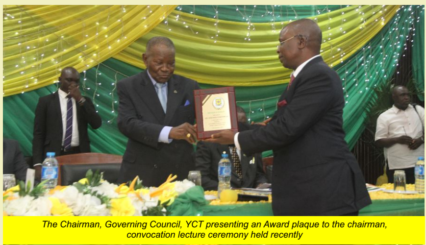
The Chairman, Governing Council, YCT presenting an Award plaque to the chairman, convocation lecture ceremony held recently

It reads: "This young gem graduated with B.Sc. (General Engineering – Civil and Mechanical Engineering) in June 1957 having notable first in First Class in Theory of Structures and all Mechanical subjects and First Class in Mechanical Design. In July 1958, this rare gem achieved yet another feat by bagging B.Sc. (First Class Honours) degree in Mechanical Engineering.