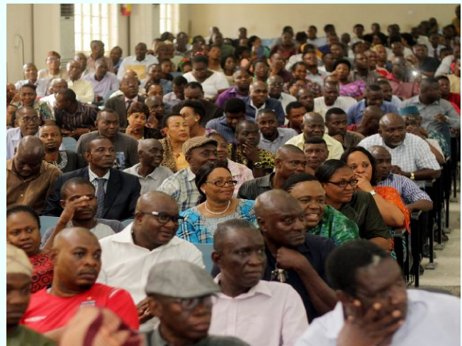
A Cross Section of Staff Alumni and other dignitaries at the Alumni Lecture series

He said that the inauguration ceremony was organized to stress the importance of Dean's office, in view of the key role they play to the success of the administration of teaching and learning in the College.