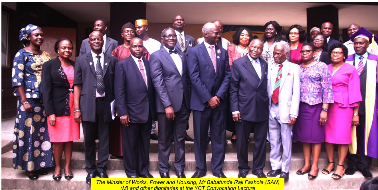
The Minister of Works, Power and Housing, Mr Babatunde Raji Fashola (SAN) (M) and other dignitaries at the YCT Convocation Lecture

“The second request is with respect to the